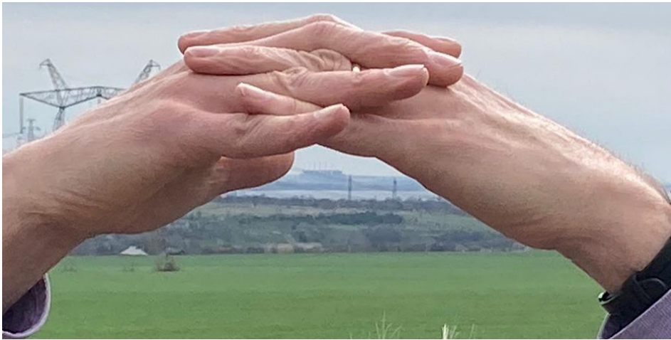
Hands of protection over Ukraine's Zaporizhzhia Nuclear Power Plant

Protection Project, an innovative peace initiative that seeks to engage unarmed civilians in the establishment of a no-fire zone around the Zaporizhzhia Nuclear Power Plant (ZNPP), the largest nuclear power plant in Europe.