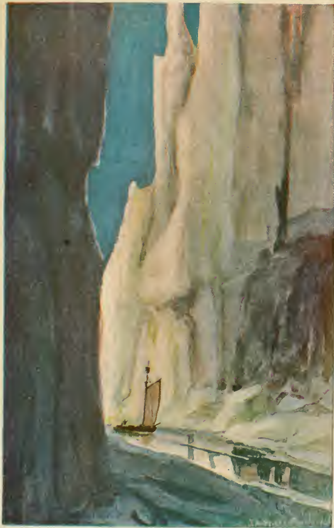
"A vessel larger than our little fishing sloop could not have threaded its way among the icebergs."